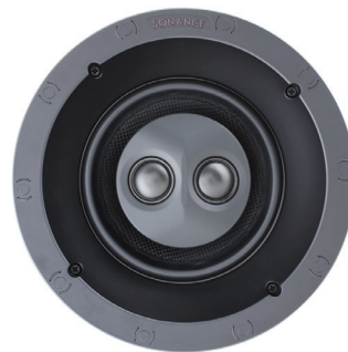
VP62R SST/SUR TL