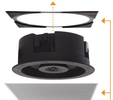
Square Adaptor w/ Grille